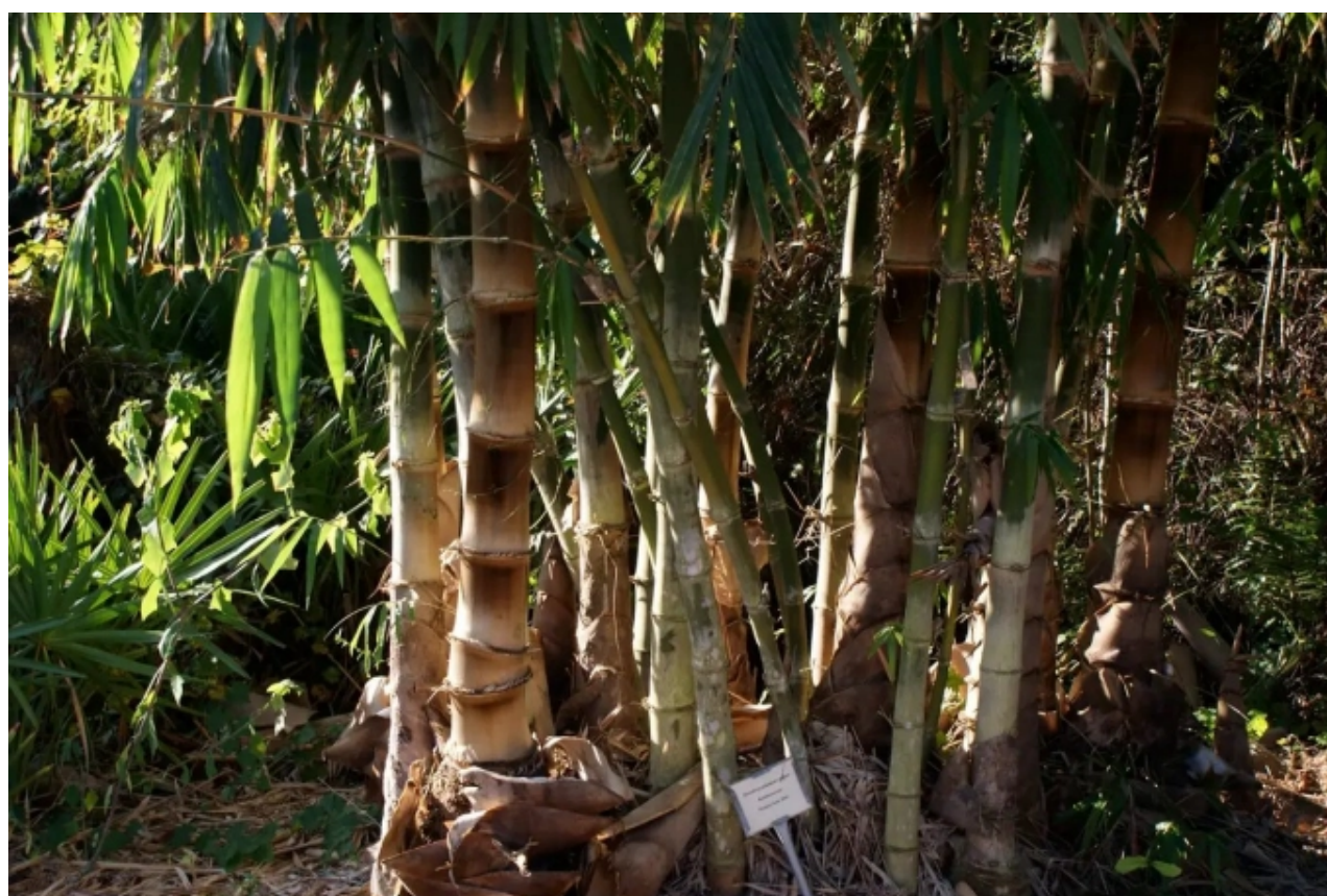
Manh Tong bamboo – a giant bamboo variety that can absorb more CO 2 than common bamboo.

It can be said that bamboo is the regenerative material of the future as it has the fastest growth and maturity speed of all trees, only 3 to 5 years. Another thing is that bamboo can regenerate itself without having to replant after harvesting, and it does not require much care or pesticides to grow.